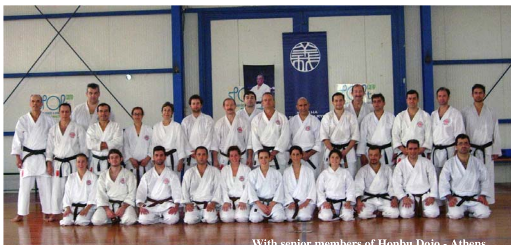
With senior members of Honbu Dojo - Athens