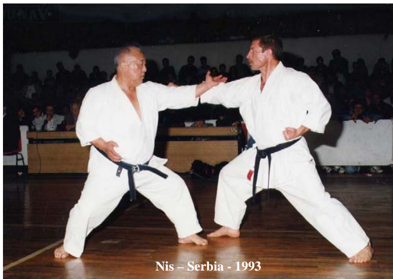
Nis – Serbia - 1993

In my town Nis, we had a two days course with more than 200 people and almost 3000 people watching.