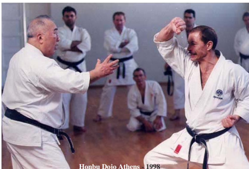
Honbu Dojo Athens - 1998

Third level is actually new generation of karateka educated according to the standards and the method of our style.