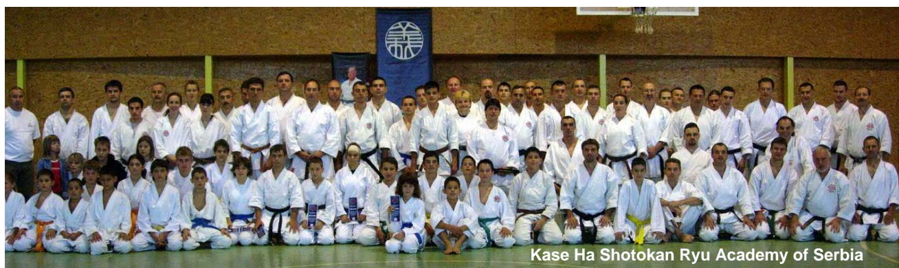
Kase Ha Shotokan Ryu Academy of Serbia

You created your own organisation kase Ha. Can you please tell us your organisation and its influence in your country ?